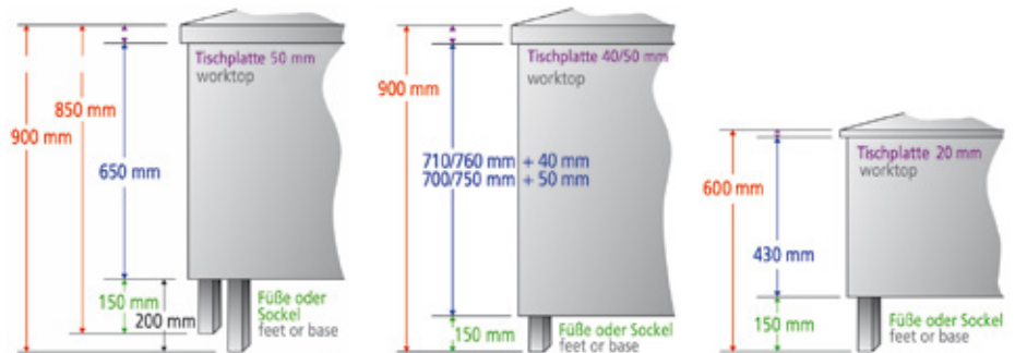
■ GN 1/1, GN 2/1, GN 2/3, EN 6040

Choose from different counter heights and GN dimensions, depending on your needs.